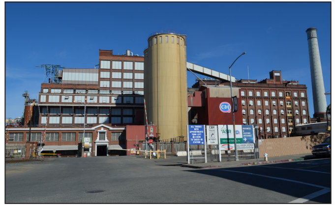
C & H Sugar factory