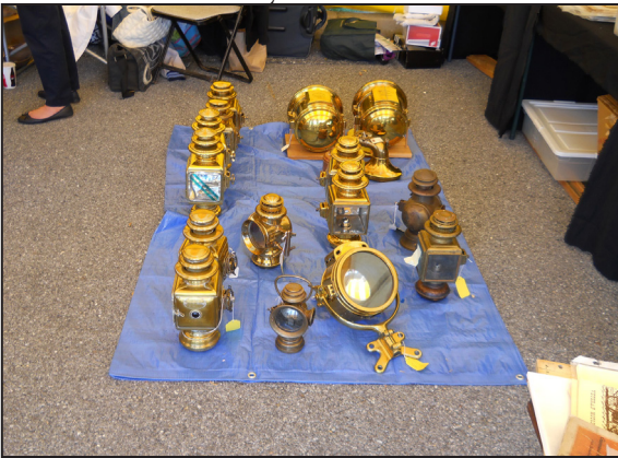
Yet More. . . . .