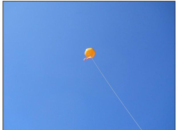
A huge helium balloon looms aloft so you can see where the HCCA tent is from everywhere