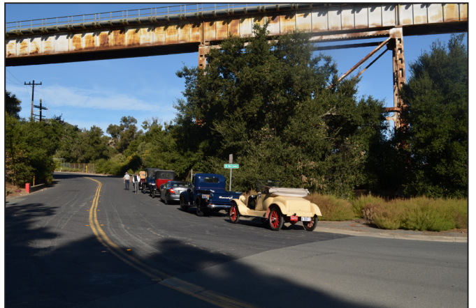
All lined up and ready to start