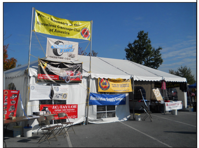
The HCCA Hershey Tent