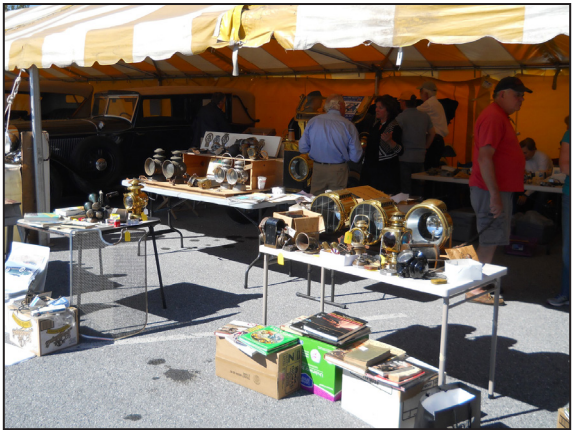
Another impressive supply of rare brass items