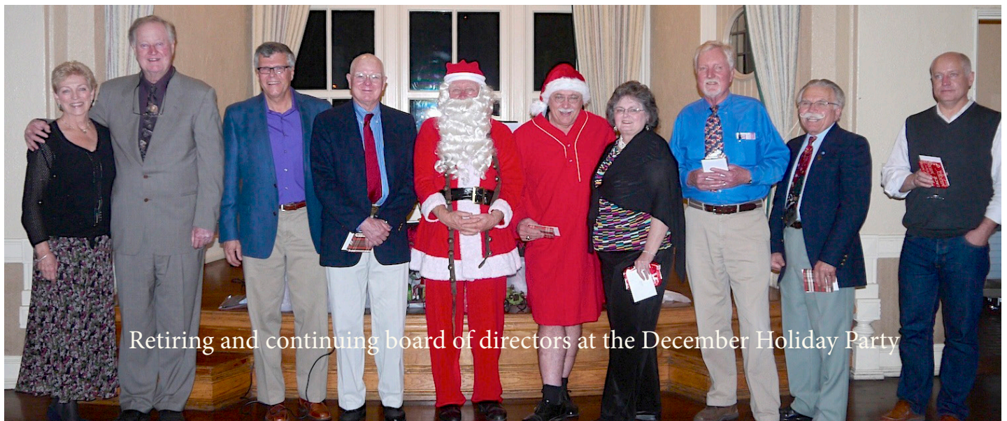
Retiring and continuing board of directors at the December Holiday Party