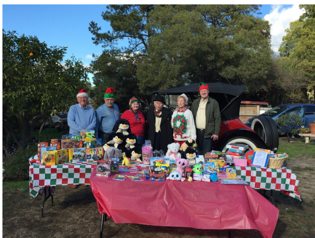
On display - all the presents donated to UCSF Benioff Children's Hospital by our club