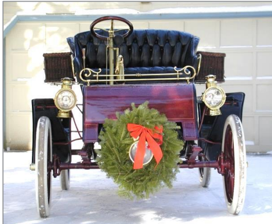
1903 Ford Model A Rear-Entrance Tonneau, CT

As the winter closes in for some of the members (above the equator), it gives us time to complete our goals for the year and start to make plans for the next year to be greater than the last year. But before we do, the HCCA Board of Directors would like to extend to you, your family and friends the greatest Happiest Holiday and New Year. Don't procrastinate, now is the time to get your antique vehicles ready for the next touring season. Stay safe and healthy. If your weather is getting warm, drive safely during the touring season.