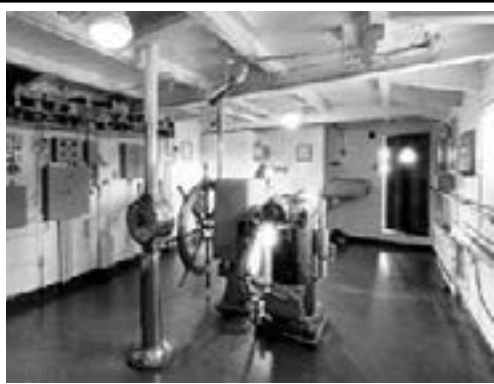
The enclosed bridge

Launched on June 19, 1943 from South Portland, Maine, the SS Jeremiah O'Brien is the sole survivor of the 6,000-ship armada that stormed Normandy on D-Day, 1944. The O'Brien made seven World War II voyages, ranging from England and Northern Ireland to South America, to India and Australia. The vessel also made 11 crossings of the English Channel carrying personnel and supplies to the Normandy beaches in support of the D-Day invasion. After the war, the O'Brien was «mothballed» at Suisun Bay, north of San Francisco.