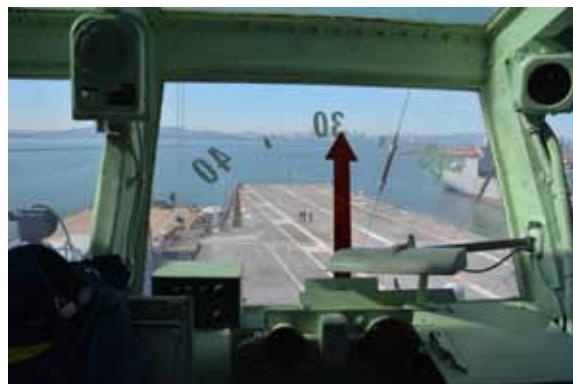
Flight Operations Center