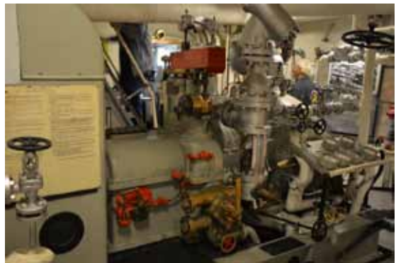
Steam Powered Generator