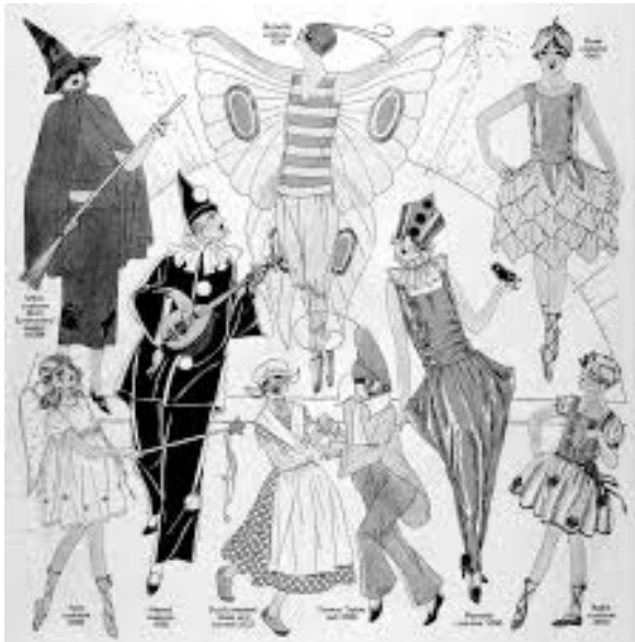
Halloween Costumes of earlier times.