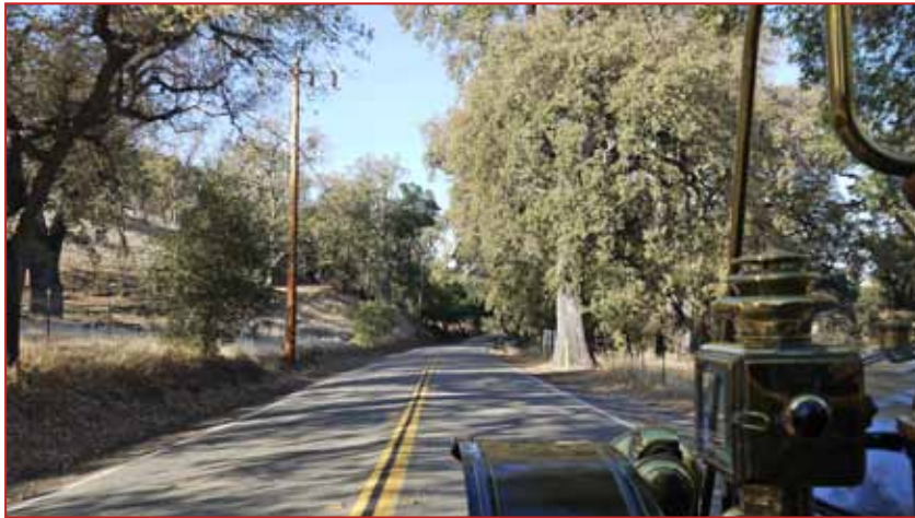
Final Leg of journey