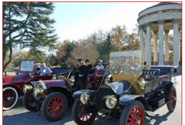
Valley Springs Vater Temple