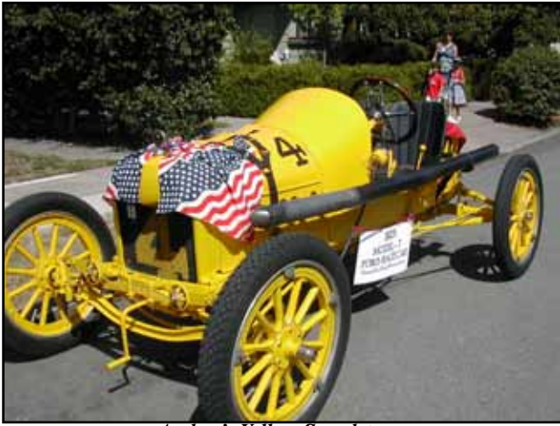
Archer's Yellow Speedster