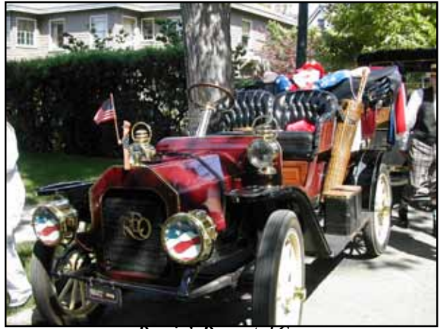
Durein's Decorated Car