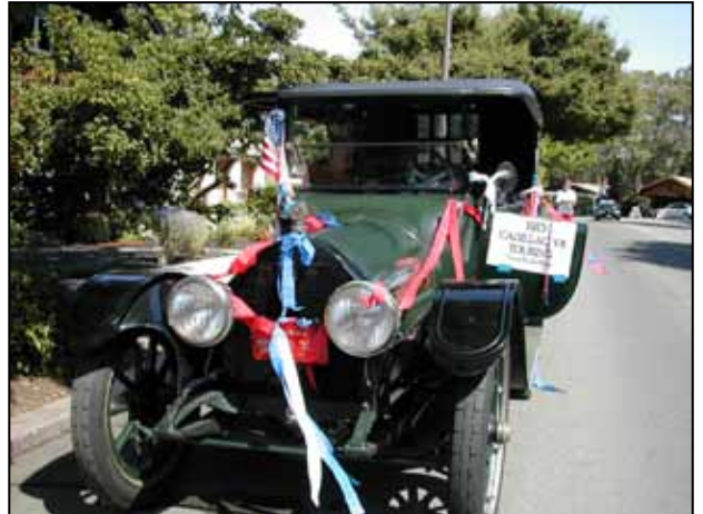
Green's Car ready for 4th