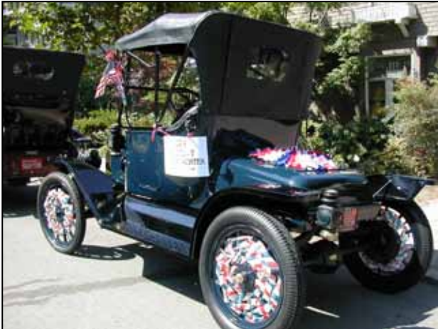
Hund's Decorated Car