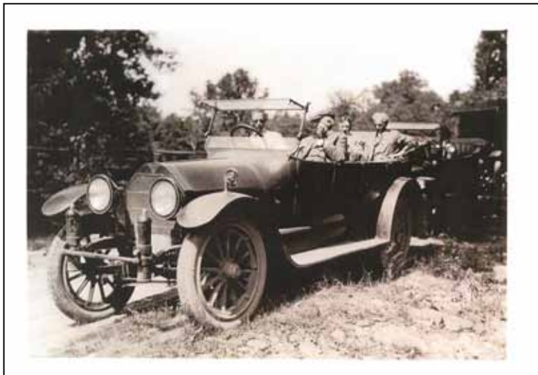
Simplex owned by Thomas Edison