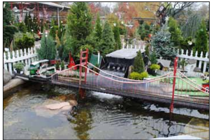
Train around the pond at the nursery