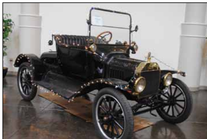
Decorating Motel T Style