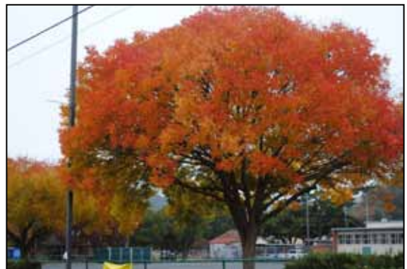
Beautiful tree in Martinez