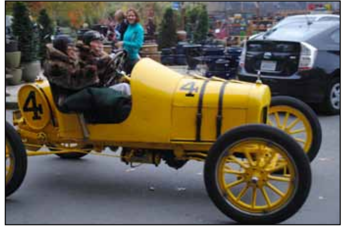
Archer Model T