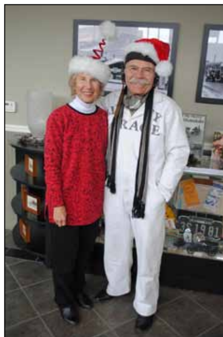
Archers always have fun