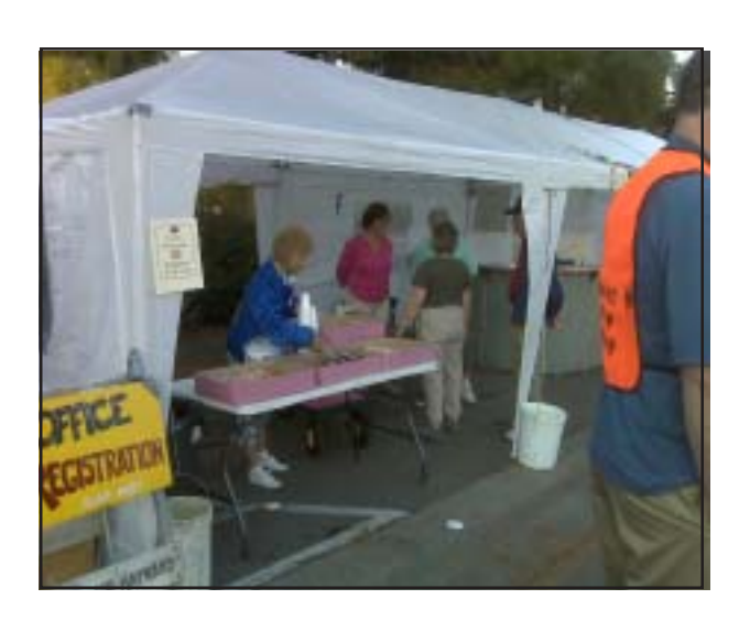
DONUTS FOR SALE!