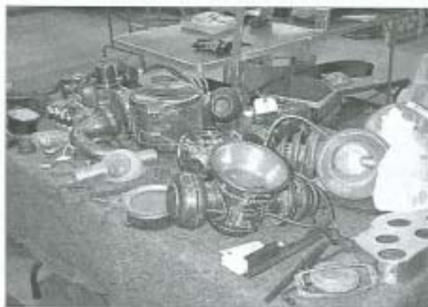
File photo. Air Capital Swap Meet 3-18-03 By Roland Dickey

John uses four-aught (0000) fine steel wool to burnish the cleaned brass parts, making his restored clock mechanisms gleam. Commercial-strength ammonia fumes are undeniably obnoxious, but the results of using this clockman's cleaning solution are worth enduring the temporary unpleasantness. The telltale smell, of course, evaporates shortly.