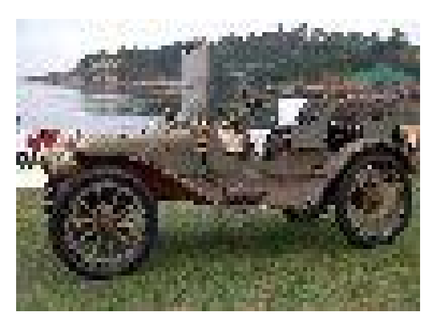
FORD MODEL K

Clive Cussler is one of the most intriguing story tellers, and is one of the most technically correct authors. Many of his stories are fashioned after "fact", and whether the Flathead Lake railroad is one of these, he hasn't said. When it comes to historical old automobiles. Cussler, a definite car enthusiast, defines every idiosyncrasy on the old cars from the driver setting the spark, setting the throttle, spinning the crank, easing off on the clutch. You can hear the tires blow out when hitting a rock, and patching the tubes before the next blowout. The wind is blowing past your face, and you can picture the roads in 1906, honking horns to get cars and hay wagons out of your way. He owns quite a collection of Pre-War cars including some of the rare horseless carriage cars described in this book.